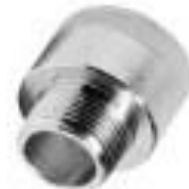
285-0350 Bushing Adaptor