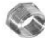
28R-2404 Bushing Adaptor